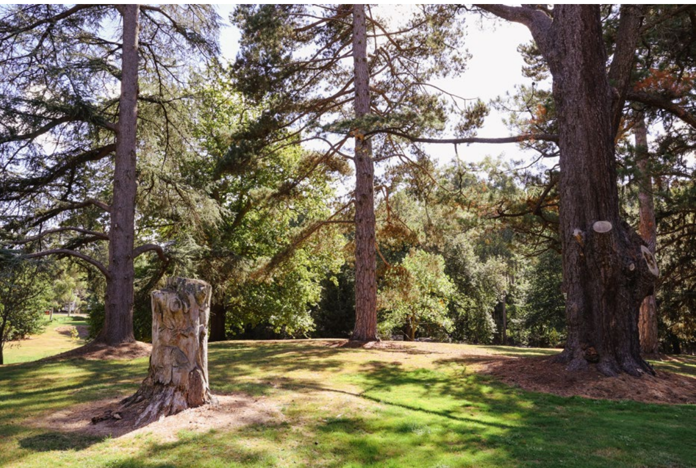
Korumburra Botanic Park