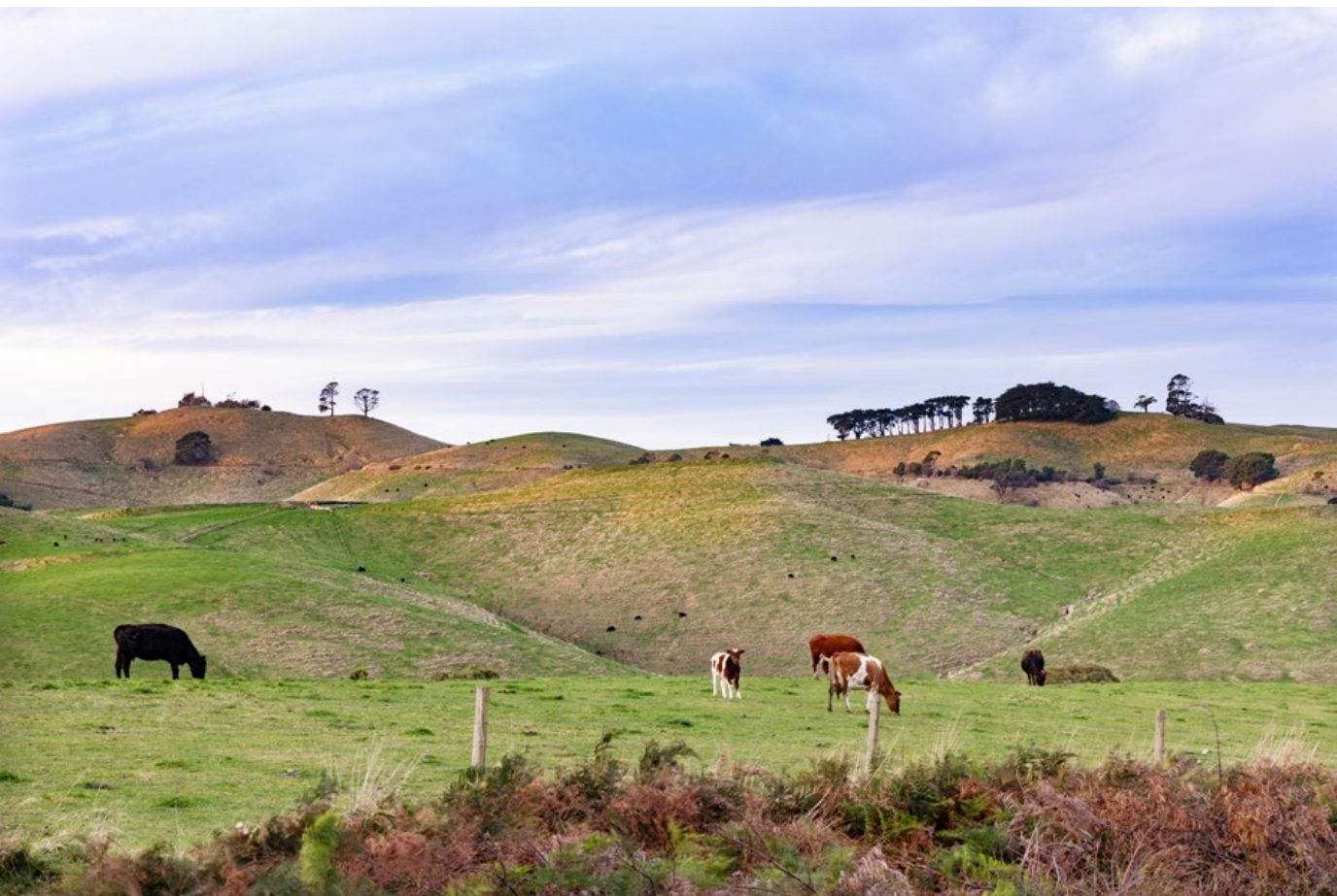
Paddocks between Korumburra and Leongatha

Township Land Capability Assessments are used to provide detailed investigation in areas of excessive risk to determine the limiting risk factors and appropriate design standards for on-site wastewater treatment systems.