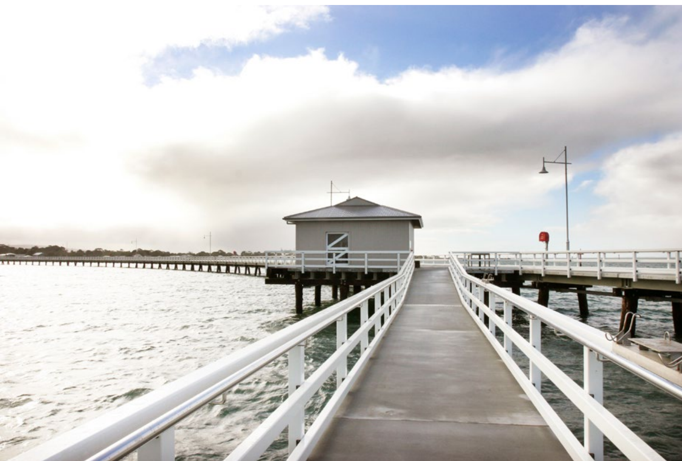
Port Welshpool Long Jetty