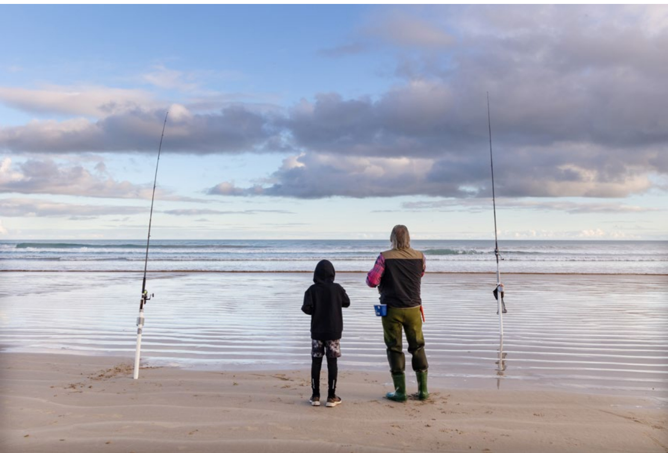
Fishing at Sandy Point

Council commits to implementing these strategies to improve the management of wastewater across the municipality. The success of this Plan relies upon the active involvement of all stakeholders and Council. Actions identified will contribute to the implementation of these strategies and will be monitored annually and reviewed every five years.