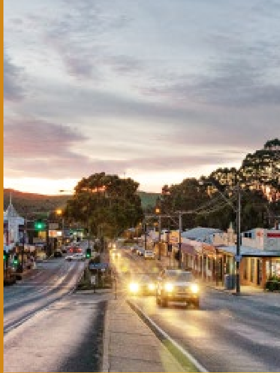
Main Street, Korumburra