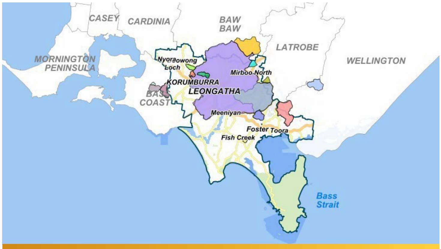
Figure One – South Gippsland Shire Council wastewater areas.

The relationships between South Gippsland Water and South Gippsland Shire is ongoing, collaborative and has resulted in benefits for both parties.