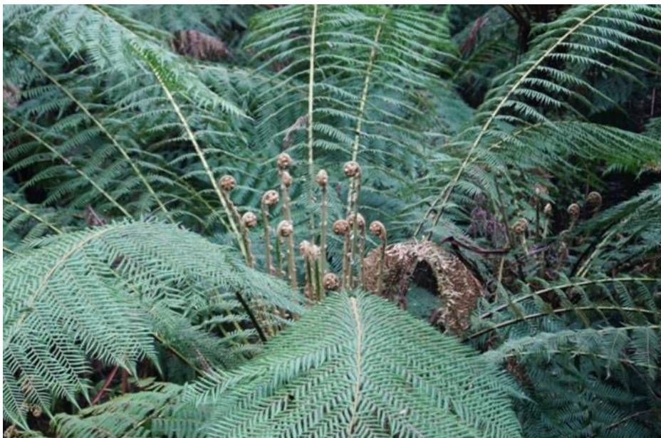
Figure 4: Tree ferns abound in the Turtons Creek Scenic Reserve.

To recognise the natural beauty and heritage values of the Turtons Creek area, and to protect, restore and enhance the area enabling tourism and recreational opportunities that are in harmony with these values.