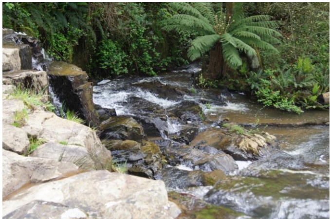
Figure 7: Mini Falls along Turtons Creek

The opportunity exists to revegetate areas on the eastern side of the creek between the creek and the road. This would form part of an overall native vegetation corridor along the length of the creek. The width of such a corridor would vary greatly with the road being close to the creek in a number of places.