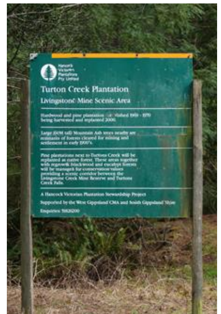
Figure 5: Photo of Stewardship Sign

A Hancocks Victorian Plantation Stewardship Project supported by the West Gippsland CMA and South Gippsland Shire. "