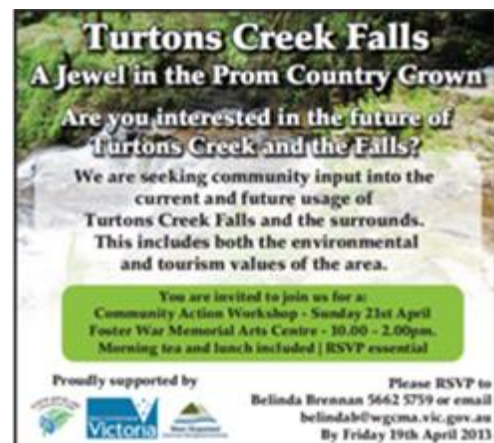
Figure 2: Example of media ad as part of the community consultation process

A fantastic turnout to the Community Action Workshop for Turtons Creek and the Falls on Sun 21 st April, 2013 reinforced the importance of the area and the need to protect its natural beauty.