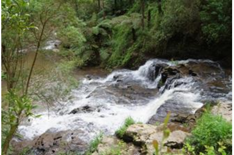
Figure 8: Turtons Creek Falls

However, since that time the area is no longer under control of Parks Victoria and the responsibility for management of the area sits with the Department of Environment and Primary Industries (DEPI) (formally Department of Sustainability and Environment). It is classified as unreserved Crown Land.