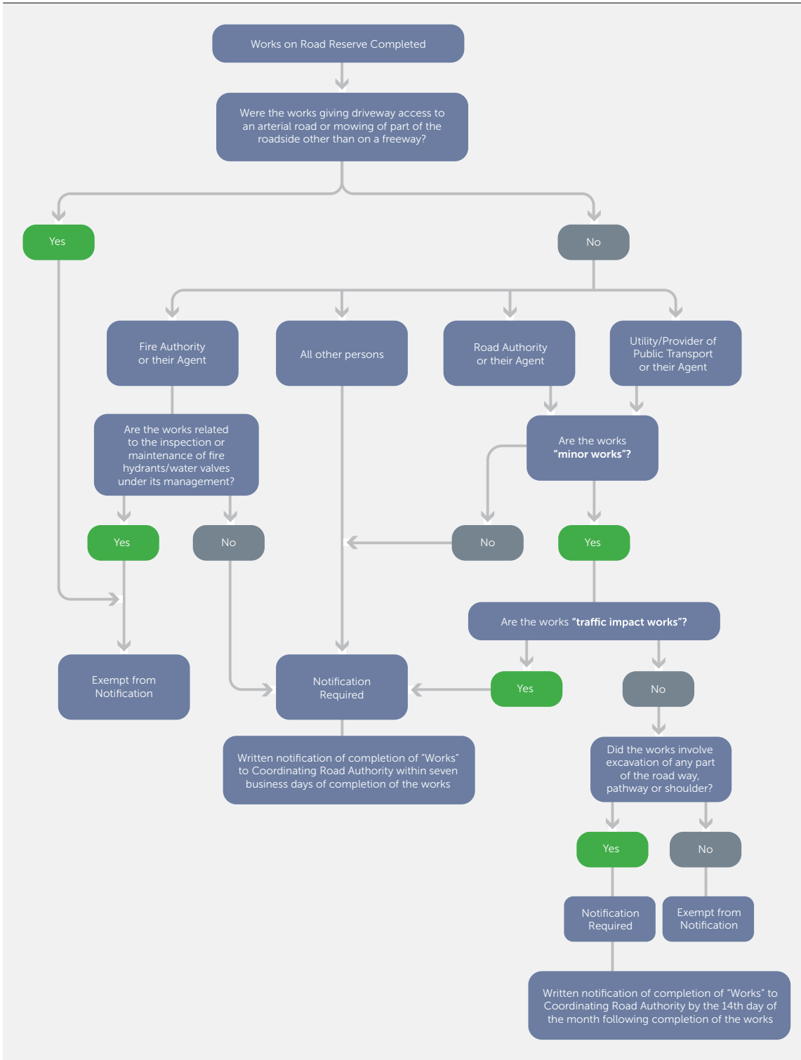
Flow Chart 3