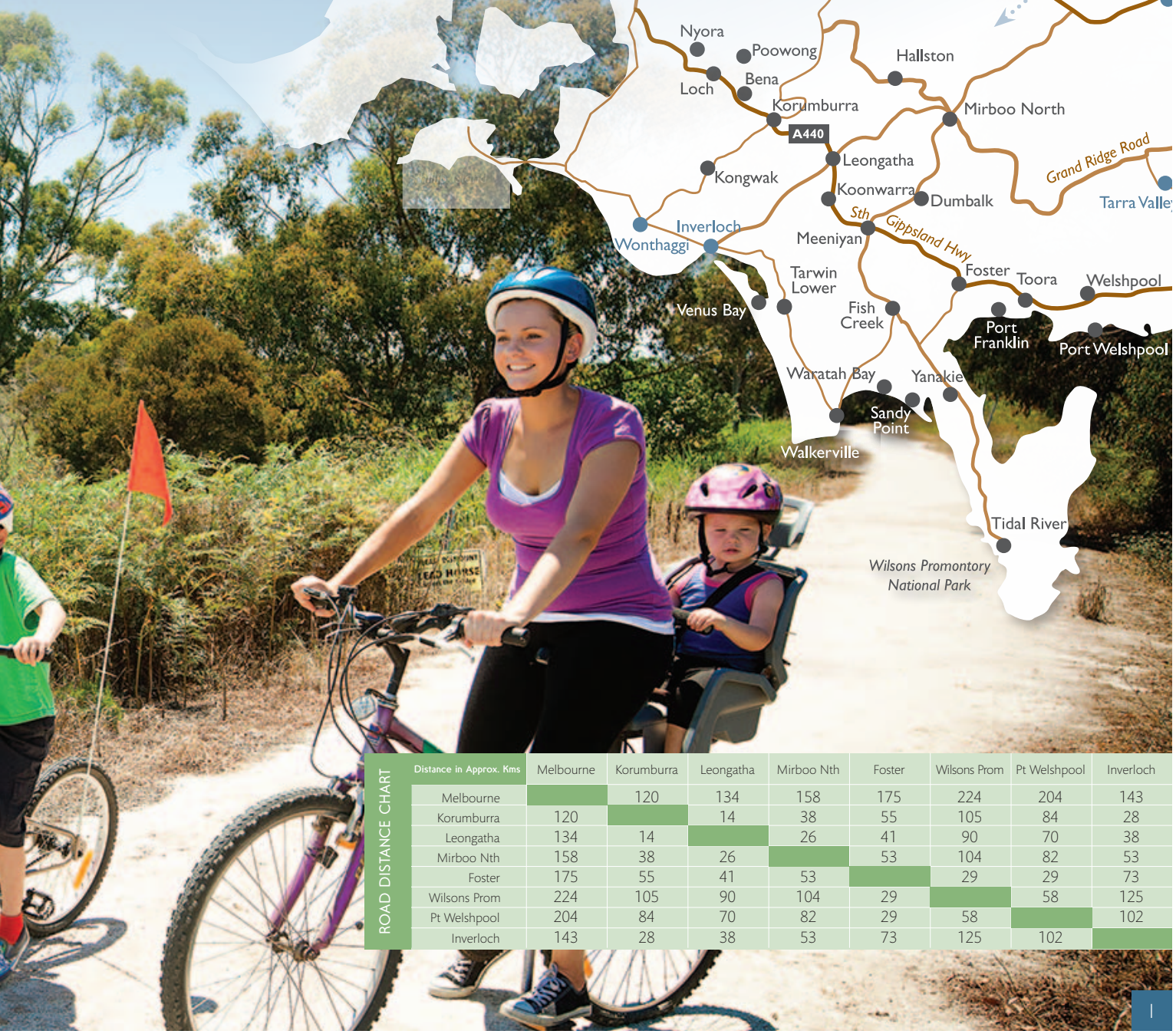
ROAD DISTANCE CHART