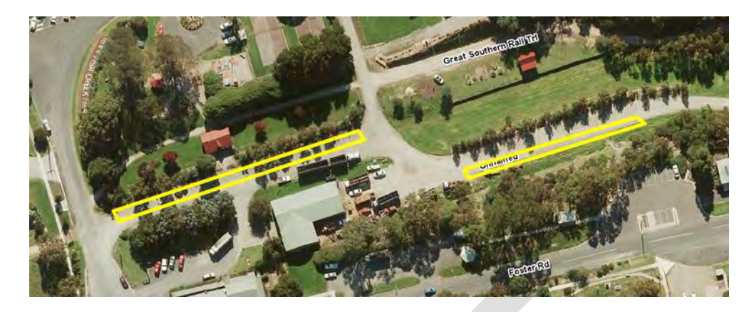
TOORA: Located at the bottom of Victoria Street, Sagassar Park is a comfortable stop for RV users, with easy access to town amenities and retail outlets.

FISH CREEK: Located beside the Great Southern Rail Trail, providing a central access point to town amenities and the retail precinct.