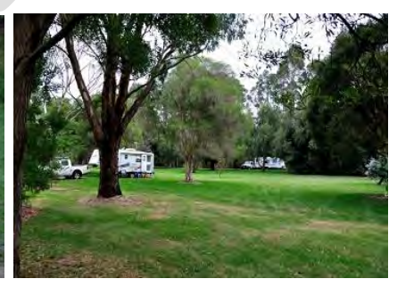
Lengthy stays and fires not in provided fire places are management issues of Franklin River Reserve