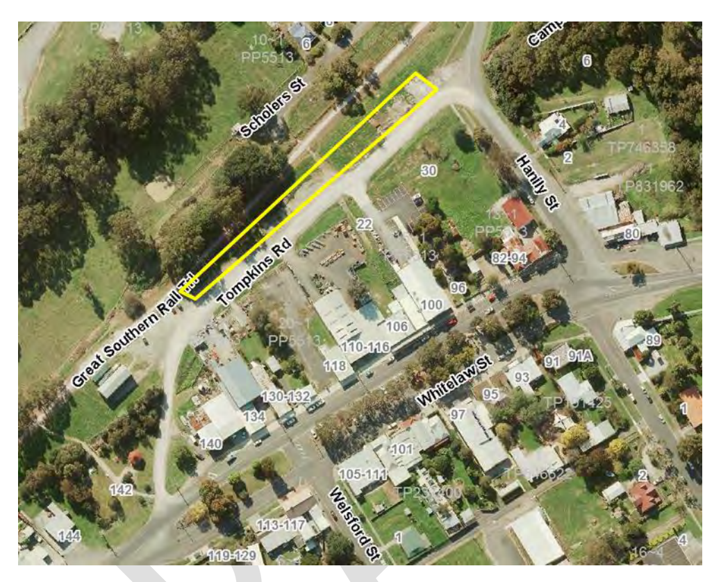
FOSTER: Located on Main Street opposite the Foster Historical Museum with easy access to the Visitor Information Centre, town amenities and the retail precinct.

MEENIYAN: Adjacent to the Great Southern Rail Trail on Tompkins Road, this gravel road is often utilised for its convenience to the retail precinct and town amenities.