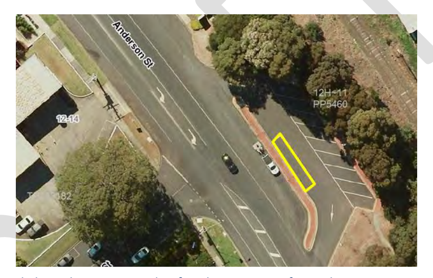
Parking also located along the western side of Anderson Street from Alison Street to Smith Street