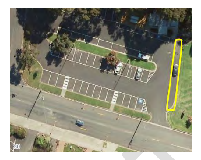
LEONGATHA: Located on the South Gippsland Highway wayside stop, opposite the Leongatha Police Station.

MIRBOO NORTH: Located on the Corner of Baths Road and Ridgeway in the Baromi Park car park opposite the former Shire Hall.