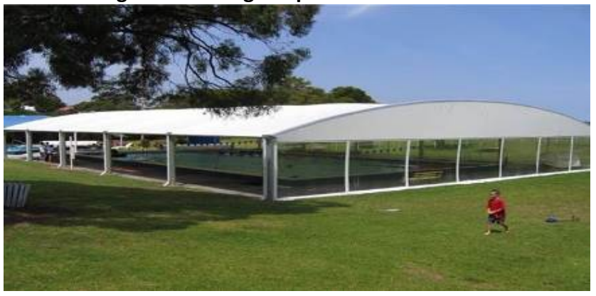
Modern facilities including family / disabled change room