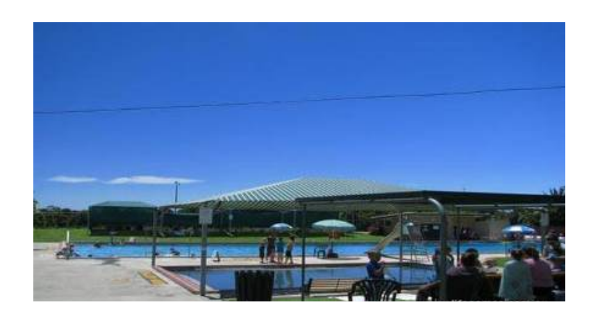
35m x 6 lane pool Toddlers' pool