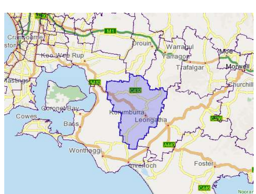
Figure 2. Trade area of Korumburra town centre

All of these centres have supermarkets and compete with Korumburra town centre for the spending of local residents on food and groceries and convenience items. These larger centres also compete strongly in non-food segments such as clothing, homewares and recreational goods (each of the main surrounding centres except Leongatha has a discount department store).