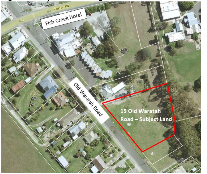
Figure 1. Proposed rezoning of 15 Old Waratah Road from PPRZ to TZ.

The subject land is owned by Council and has been identified by Council's 'Strategic Review of Landholdings Project' as excess to Council's needs and appropriate for sale. Rezoning of the land from the PPRZ to the TZ is required before the land can be sold. Public notice of Council's intention to sell the land occurred in December 2015 and no objections were received.