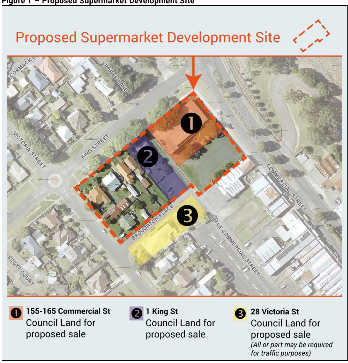
Figure 1 - Proposed Supermarket Development Site

Council has been approached by a supermarket development company that seeks to purchase various Council properties in order to assemble a development site large enough to cater for a full line supermarket and associated car parking (the Proposed Development). The site for the Proposed Development is shown bordered in orange in Figure 1 below. The Council properties for proposed sale as part of the Proposed Development are shown shaded orange, purple, and yellow.