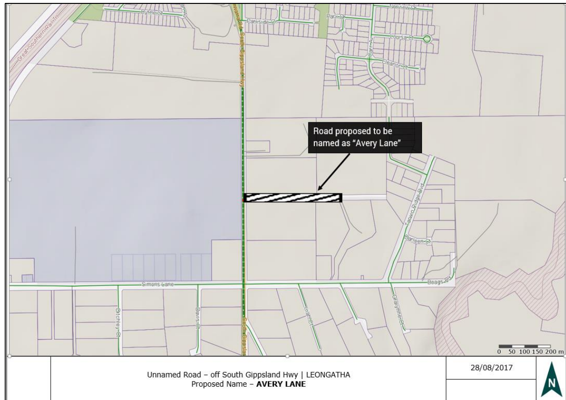
Figure 2 - VICNAMES Compliance Check

Compliance with the Naming Rules for Places in Victoria - Roads, Features, and Places 2016