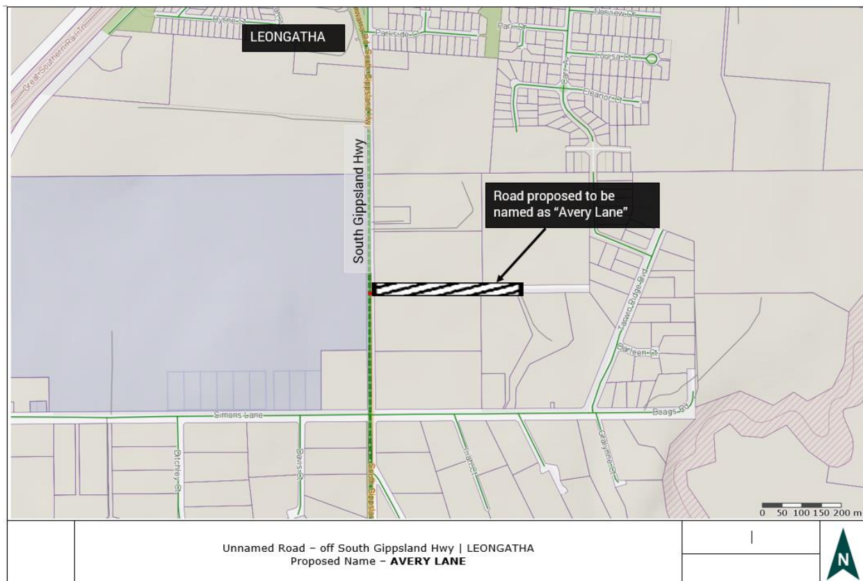
Figure 1 – Locality Map