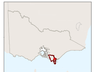
Part of Planning Scheme Maps 28LSIO & 30LSIO