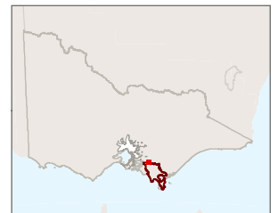
Part of Planning Scheme Map 6