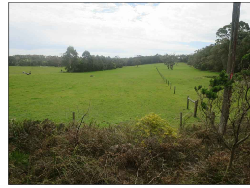
4. View from Lang Lang-Poowong Road looking north