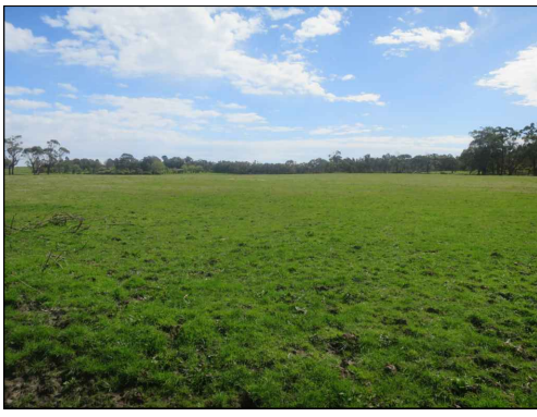
1. View from end of Hatches Road looking north west