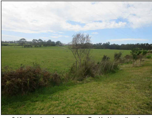
2. View from Lang Lang-Poowong Road looking north east