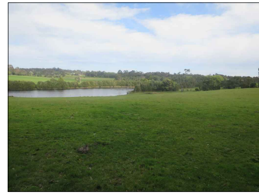
3. View from Glovers Road boundary looking south west