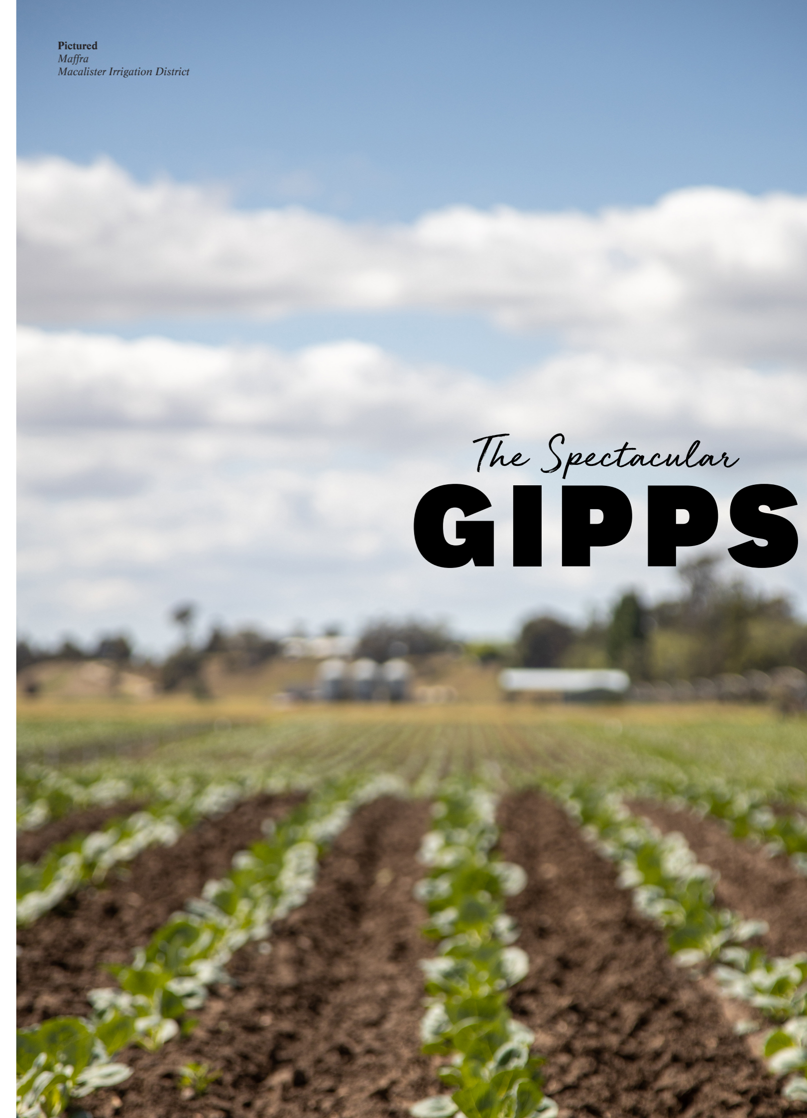
Pictured Maffra Macalister Irrigation District

Each year, nearly eight million tourists visit Gippsland, attracted to our renowned unspoilt lakes, beaches, snowfields, bushlands, and rainforests, as well as our beautiful towns and villages. Our region's vast range of stunning