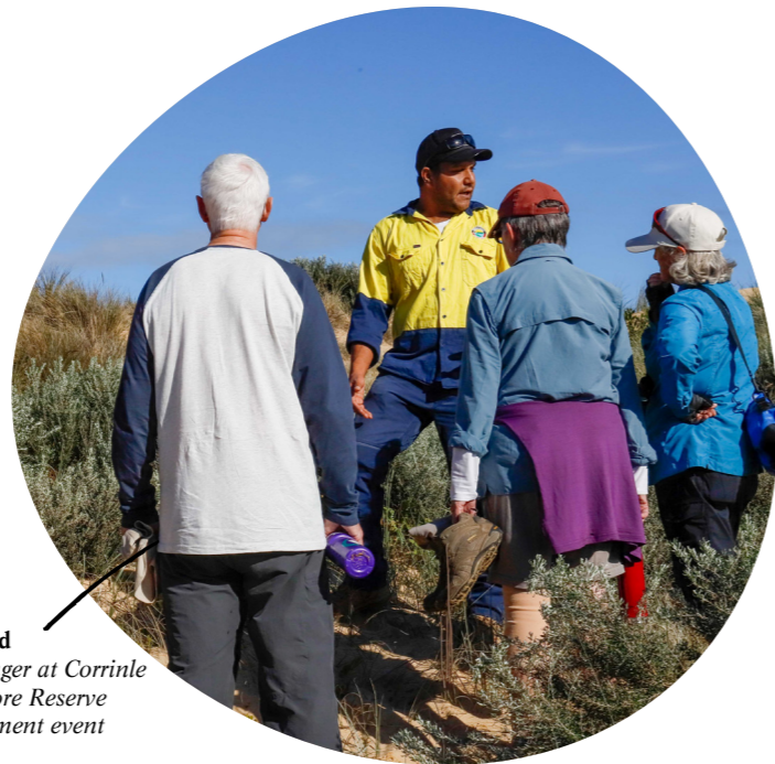
Pictured JM Ranger at Corrinle Foreshore Reserve engagement event