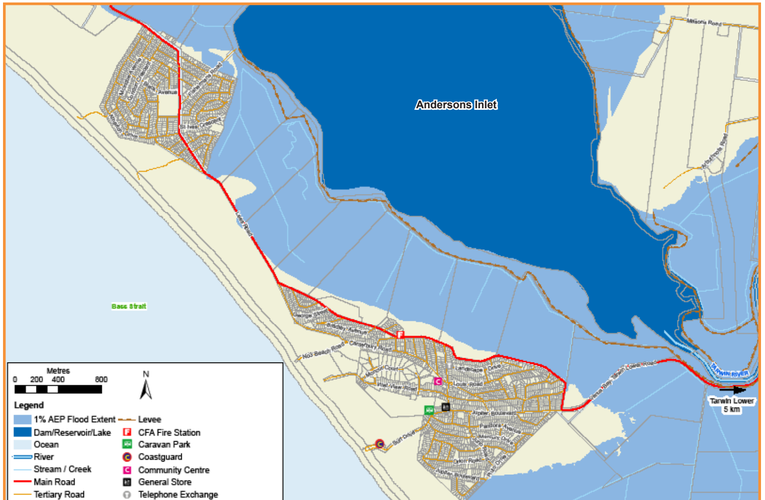
Map two: Venus Bay Riverine Flooding