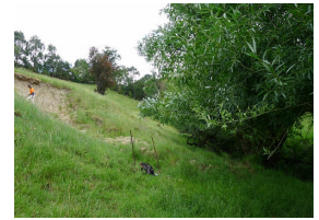
Fig. 5: Typical steep slope habitat of Giant Gippsland Earthworm

The presence of introduced herb Creeping Buttercup Ranunculus repens and yabbie mounds can indicate suitable conditions for colonies.