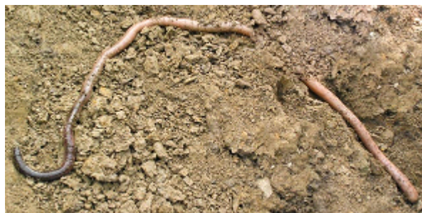
Fig. 1: Adult Giant Gippsland Earthworm exposed in burrow

GGE are hermaphroditic and breeding occurs in spring and summer. Breeding adults are recognisable by a large swelling (saddle) that occurs near their head. They lay large (up to 9cm long), amber-coloured egg cocoons, in special chambers branching from their burrows, usually within 40cm of the soil surface (Fig. 2).