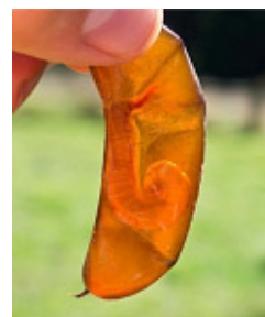
Fig. 2: Egg cocoon of Giant Gippsland Earthworm

Colonies are found mainly in two habitats: on the banks and terraces of streams and drainage channels, above the flood-level and on steep, south-facing hillsides, often with terracettes (Fig. 4 & 5). The sites away from waterways are often associated with underground springs or areas of higher soil moisture. Sites with GGE colonies generally have well-draining blue-grey clay soils or red-brown clay loam soils that, critically, remain moist year-round (Fig 6). GGE cannot survive in water-logged soils or areas subject to seasonal flooding.