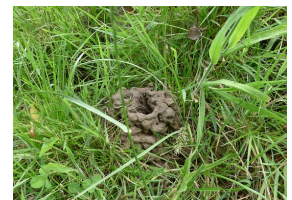
Fig. 6: Clay soil habitat with buttercups and Yabby Mound