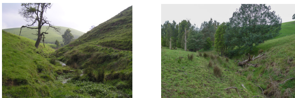
Fig. 4: Typical stream bank habitat of Giant Gippsland Earthworm