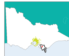
Part of Planning Scheme Map 16