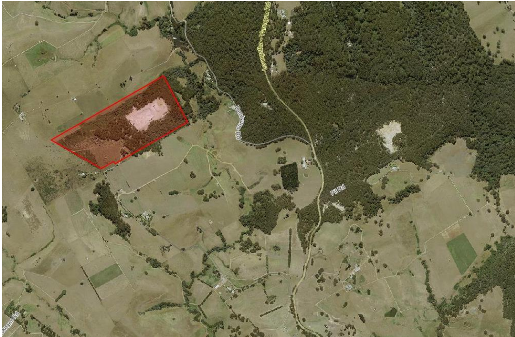
Image 2: Aerial image of subject site and surrounds.

185 Dawsons Road, Hallston – A trapezoid shaped property of 16.19ha, improved by a dwelling and a number of outbuildings. The property fronts Dawsons Road at a 90 degree bend leading into the quarry site. The dwelling on the land is located approximately 82 metres from the closest abuttal with the subject land.