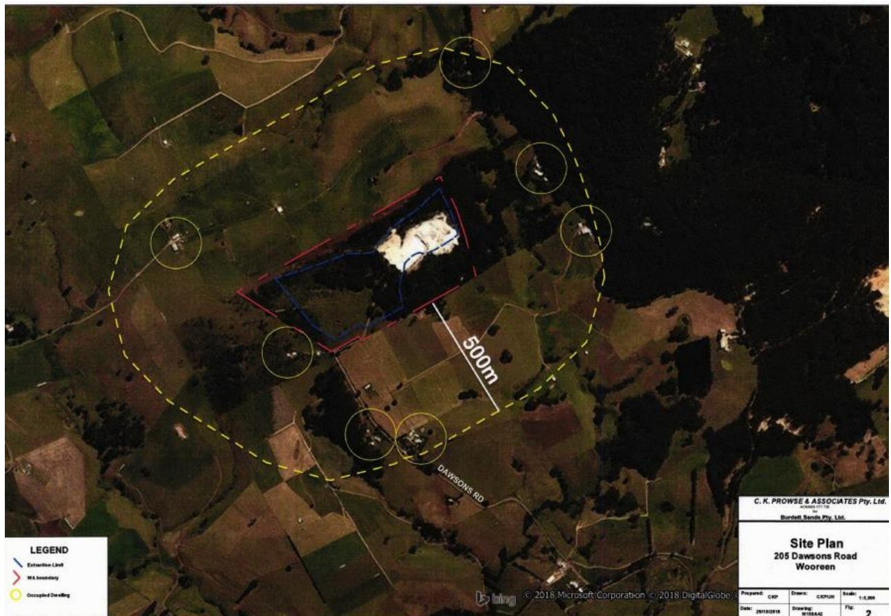
Image 1: Site Plan showing the proposed extraction limit (blue).

The accompanying documentation indicates that production from the expanded quarry would be in the range of 50,000-100,000 tonnes per annum, with an estimated lifespan of approximately 30 years. Based on an estimated truck carrying capacity of 44 tonnes, the proposal would lead to a maximum average of approximately 16 truck movements per day, 6 days per week (in practice, such movements would fluctuate based on demand). Traffic counts of Dawsons Road undertaken by South Gippsland Shire in 2010 indicated maximum per day vehicle movements of 53 vehicles, of which 27 (51%) were commercial vehicles. The proposed expansion, if operating at up to 150,000 tonnes per annum would lead to an approximate 400-500% increase in commercial vehicle movements on Dawsons Road.