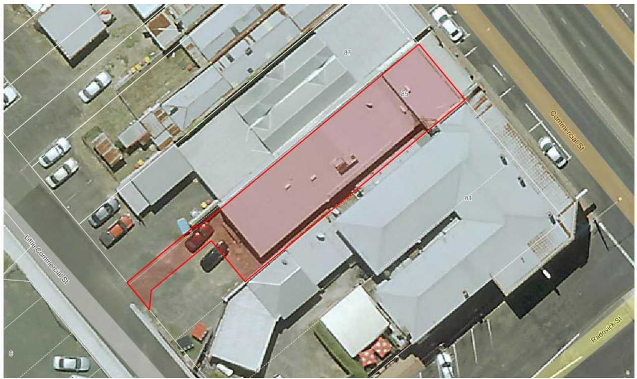
(Subject site - retrieved from Intra-maps 2018 aerial)