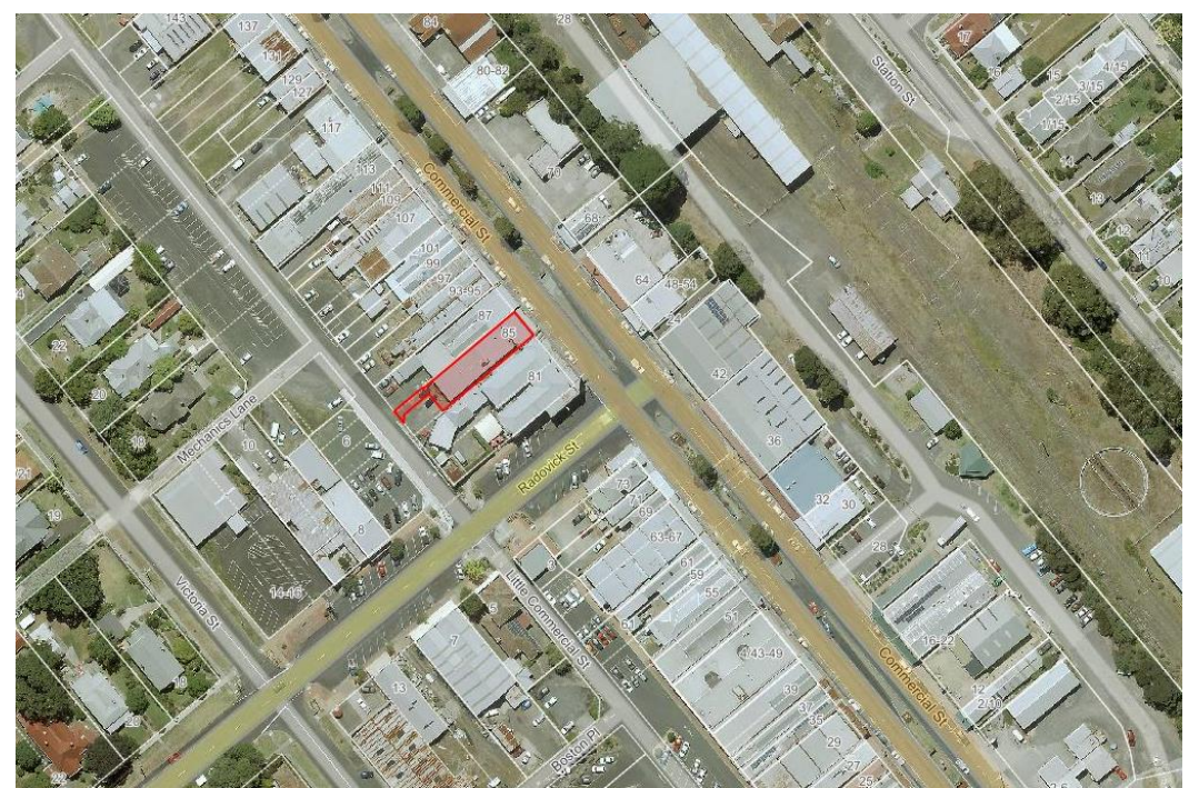
(Subject site and surrounds - retrieved from Intra-maps 2018 aerial)

Each of the commercial businesses discussed above only have space on-site (within the boundaries of the properties) to accommodate staff parking. The majority of other businesses within the main Korumburra Township rely on public on-street and off-street car parking for customers and visitors.