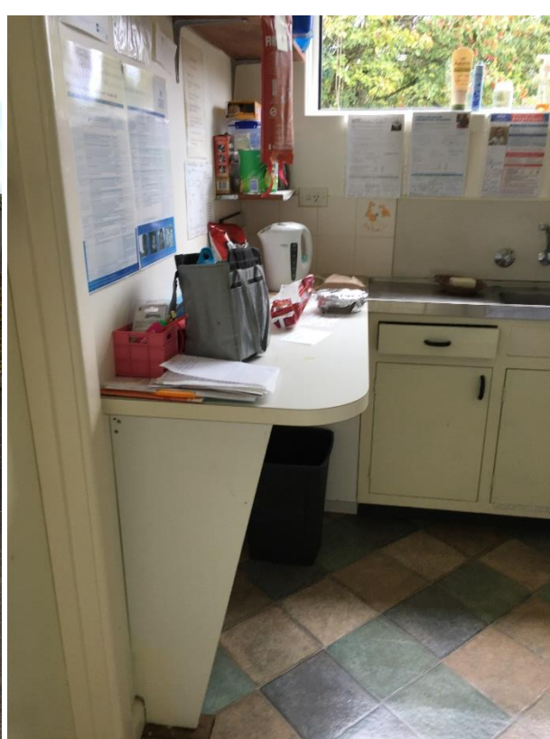
Welshpool Kindergarten, January 2019