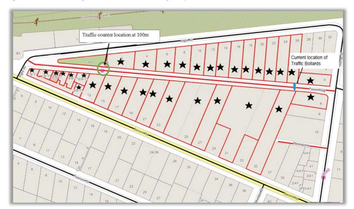
Figure 2 - Forest Way, Mirboo North Locality Map

The location of the traffic counter and current traffic bollard closure along with residents surveyed is detailed in Figure 2 .