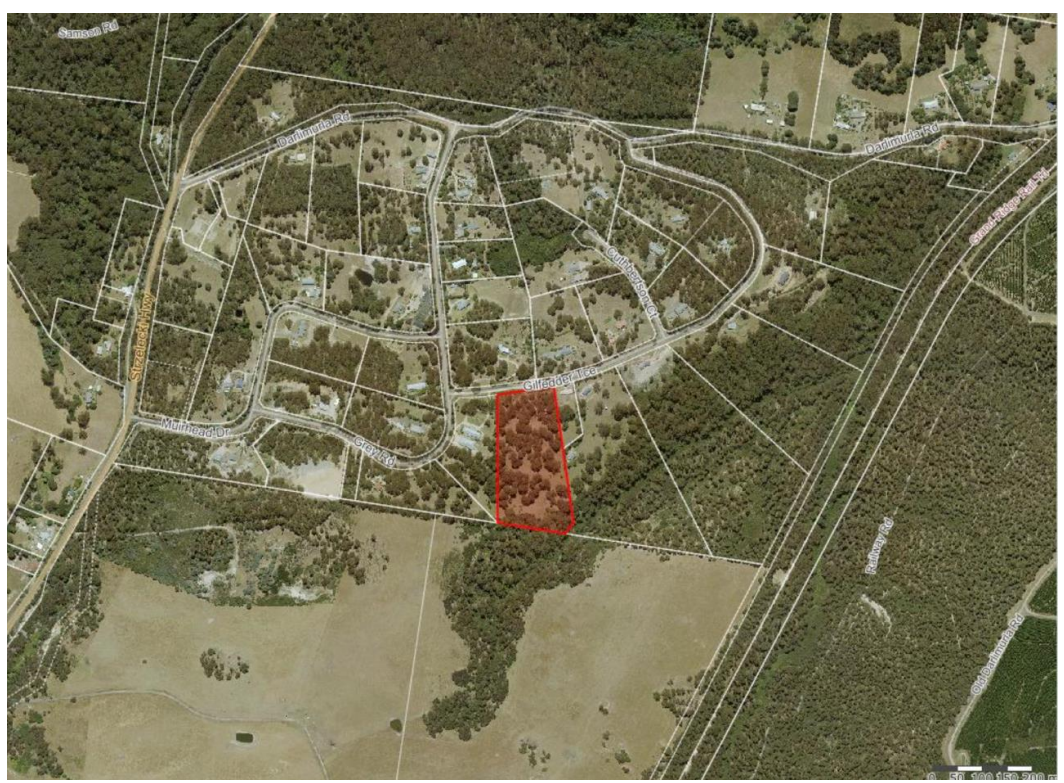
Image 3: Aerial image of subject site and surrounds.

<u>2 Gilfedder Terrace</u> – An irregular shaped property of 2.05ha, improved by a large dwelling. The dwelling and site is well screened from Grey Road and Gilfedder Terrace, however the view to and from this dwelling would be 'opened up' by the removal of vegetation on the subject land in creating defendable space for new dwellings. The dwelling on site is located approximately 35m from the western boundary of the subject land.