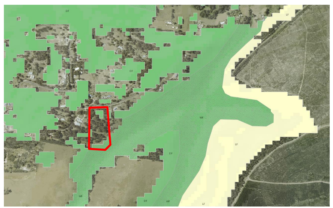
Image 5: 2005 EVC Mapping with site outlined.

removal being of virtually no consequence to this EVC type (the extent of which is shown in the image below):