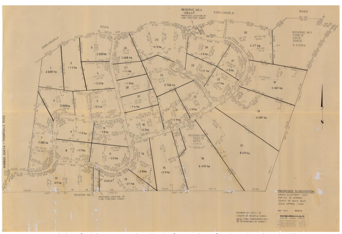
Image 2: Proposed plan of subdivision considered by the former Shire of Mirboo; the subject land being Lot 15 in this plan.

The subject site (Lot 15 PS302507G, Parish of Mirboo, County of Buln Buln), known commonly as 4 Gilfedder Terrace, Mirboo North, is a 3.87ha lot located within the 'Darlimurla Rural Living Estate'; being the area generally bounded by Strzelecki Highway, Darlimurla Road, Gilfedder Terrace, Grey Road and Muirhead Drive. This estate, including the subject land was created as a result of a 33 lot subdivision of land approved by the former Shire of Mirboo in 1990. This subdivision largely aligns with the current form of the estate, as seen in images 2-4 of this report.