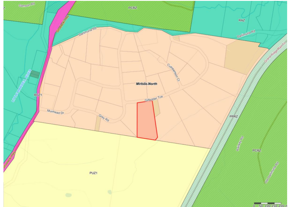
Image 4: Allotment view of subject site and surrounds overlayed with planning zones.