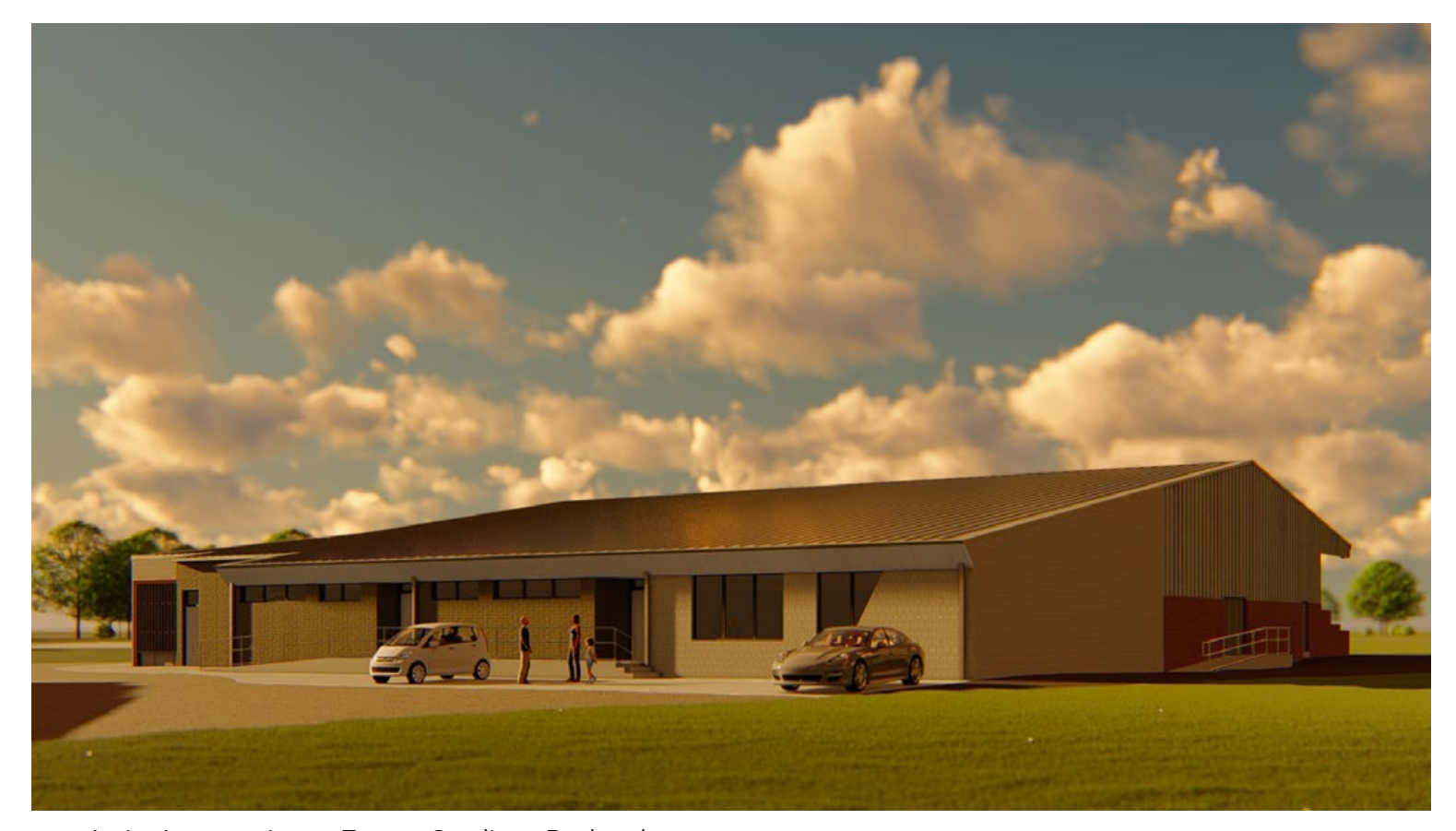
Artist impression – Foster Stadium Redevelopment