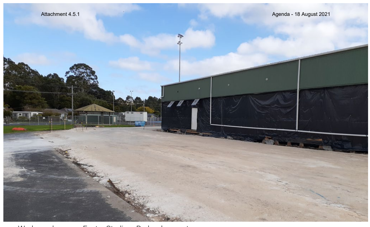
Works underway – Foster Stadium Redevelopment