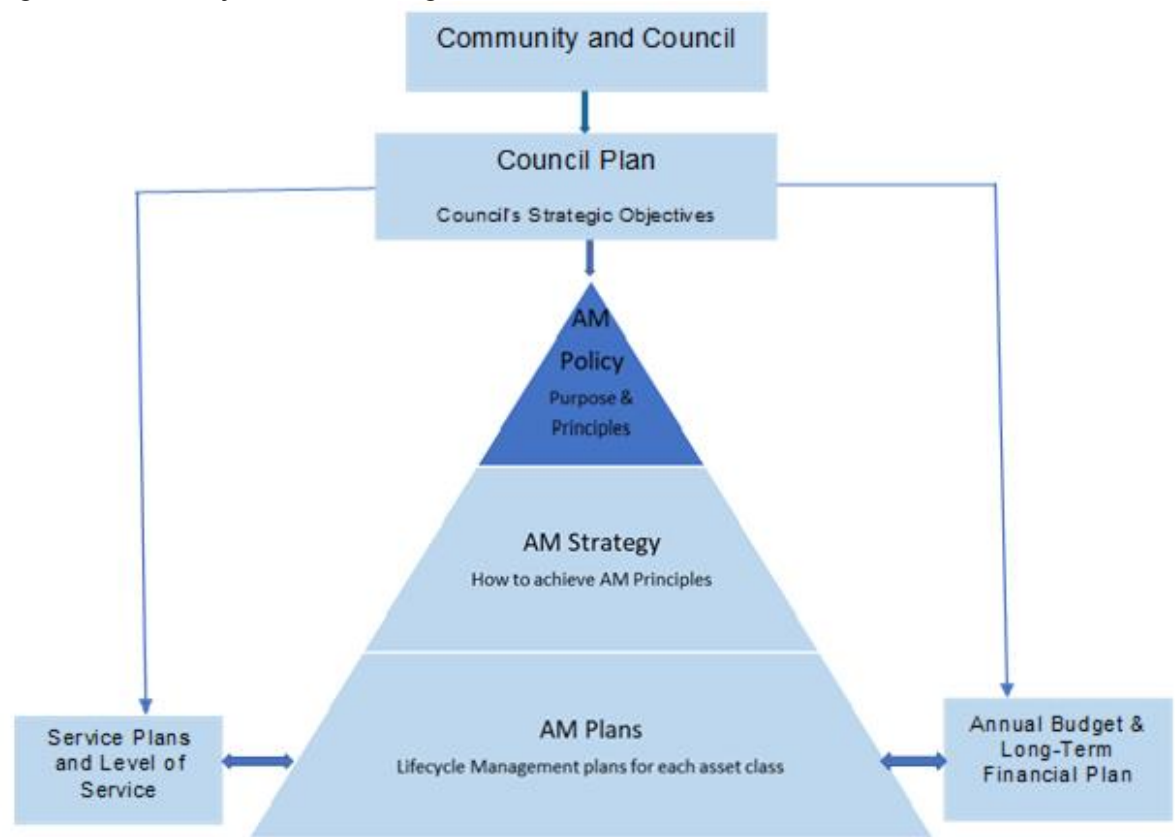
Figure 1: Hierarchy of Asset Management Documents

Figure 1 shows the relationship between the Council Plan, the Asset Management Policy, Asset Management Strategy, Asset Plans, and the Long Term Financial Plan.