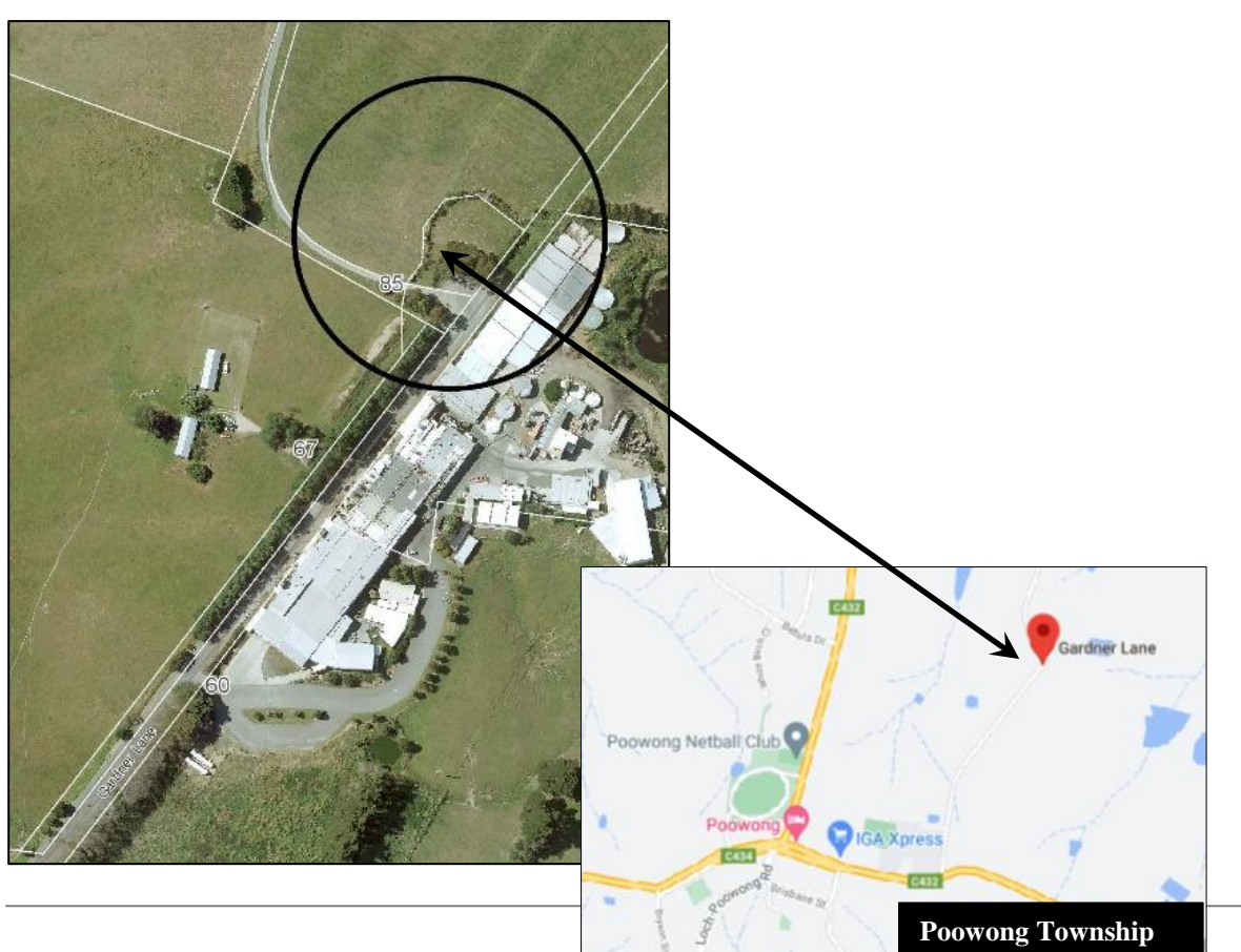
Figure 2 - Locality Map

South Gippsland Shire Council Council Meeting No. 466 - 15 December 2021