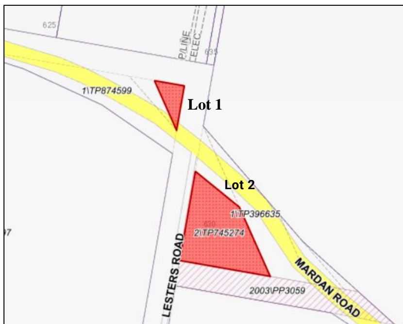
Figure 1 – 630 Mardan Road (Lot 1 and 2 TP745274)

No. 630 Mardan Road Koorooman is currently in one certificate of title volume 3403 folio 496 that includes two allotments (refer to ref shading in Figure 1 below) being Lot 1 TP745274 situated on the northern side of Mardan Road and Lot 2 TP745274 on the southern side of Mardan Road. It is the southern allotment that is proposed for sale – refer to Figure 1 .