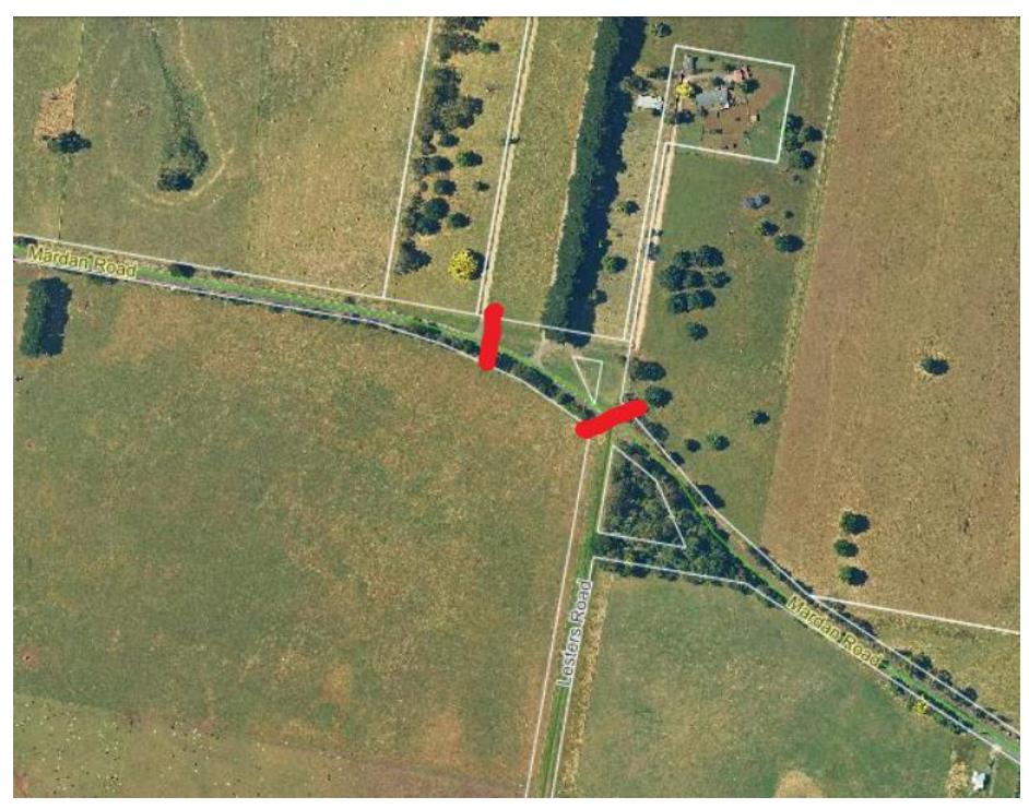
Figure 2 – Aerial of 630 Mardan Road (Proposed New Cattle Underpass

It is possible to place an underpass directly from the Lesters property in two separate positions shown on the map below, however, this would not resolve the tractor crossing.