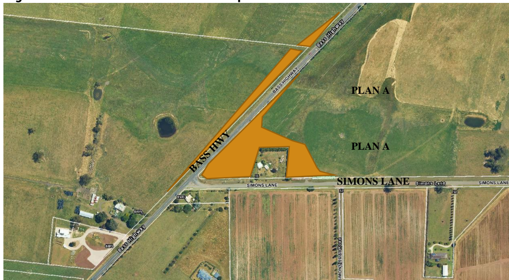
Figure 1: Location of Parcels to be Acquired

Each parcel of land to be acquired are shown in Plans A, B and C in Figures 2-4 below and full size A3 plans are available in Attachments [2.1.1], [2.1.2] and [2.1.3] .