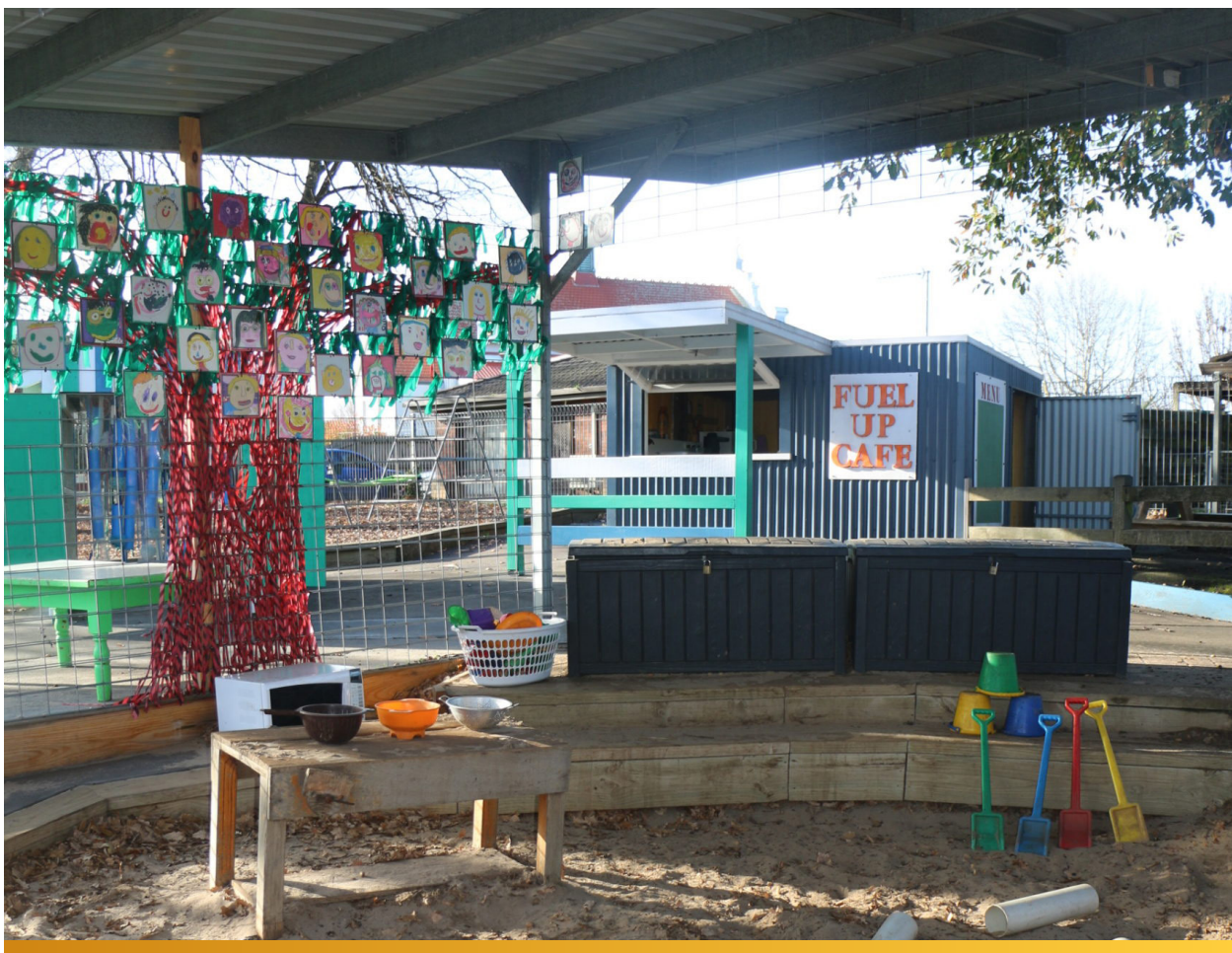
Sand Pit at Hassett Street