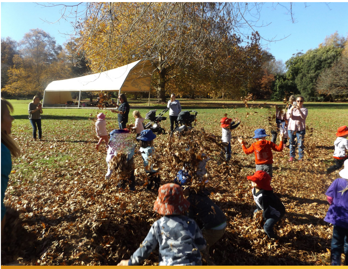
Mossvale Park excursion

The Position Paper is also informed by Council's Blueprint for Community and Economic Infrastructure which has identified the most pressing need is for renewal of existing facilities, the importance of planning for multipurpose / community hub facilities as opposed to single-use facilities, and the demand for services is expected to be strongest in the growth areas such as Korumburra, Nyora, and Leongatha, AND the 2021 Early Years Infrastructure Review which proposes a range of infrastructure changes and improvements in response to service demand, the condition of infrastructure, and the aspirations of early years' service providers.