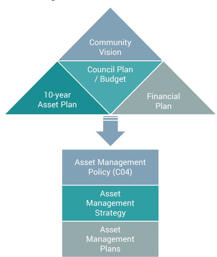
Figure 1 - Council's Asset Management Documents

The introduction of the Local Government Act 2020 included a requirement for Council to develop and adopt a 10-year Asset Plan. Figure 1 below shows how the introduction of this plan correlates to Council's key strategic plans and the asset management system documents.