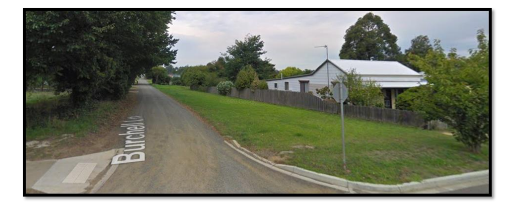
Figure 1 – View of 3 Brennan St on corner of Burchell Lane

Burchell Lane lies parallel to the main street of Mirboo North and is currently unsealed.