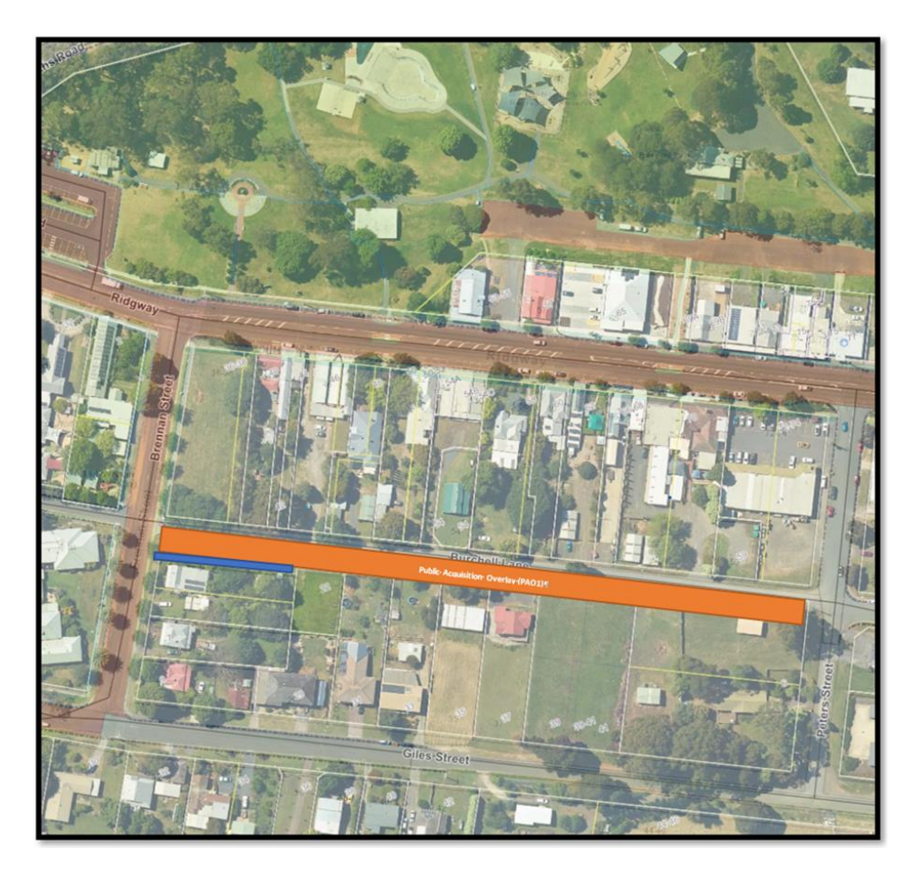
Figure 4 - Showing example of Public Acquisition Overlay along Burchell Lane in orange and the lot to be created and sold in blue.

This property matter does not propose that the road will be sealed.