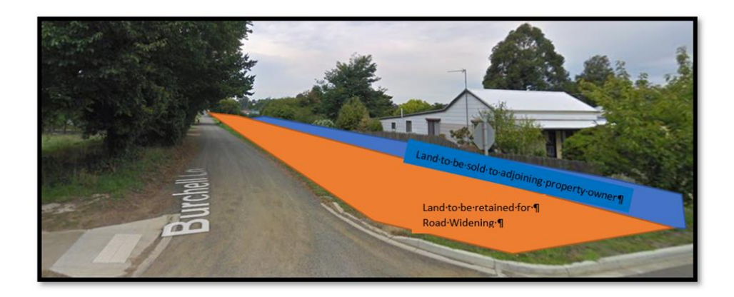
Figure 3 - Annotated image of Cnr. Brennan St and Burchell Lane

After consultation with Council's Strategic Planners, selling the portion of land will still allow for the widening of Burchell Lane to assist future development and this will also align the existing PAO within Burchell Lane as shown in Figure 4 . The area shown orange in Figure 3 aligns with the existing road reserve width in parts of Burchell Lane, Mirboo North. The sale of the land shown blue and consolidation with 5 Brennan Street, Mirboo North will help align the road reserve boundaries.