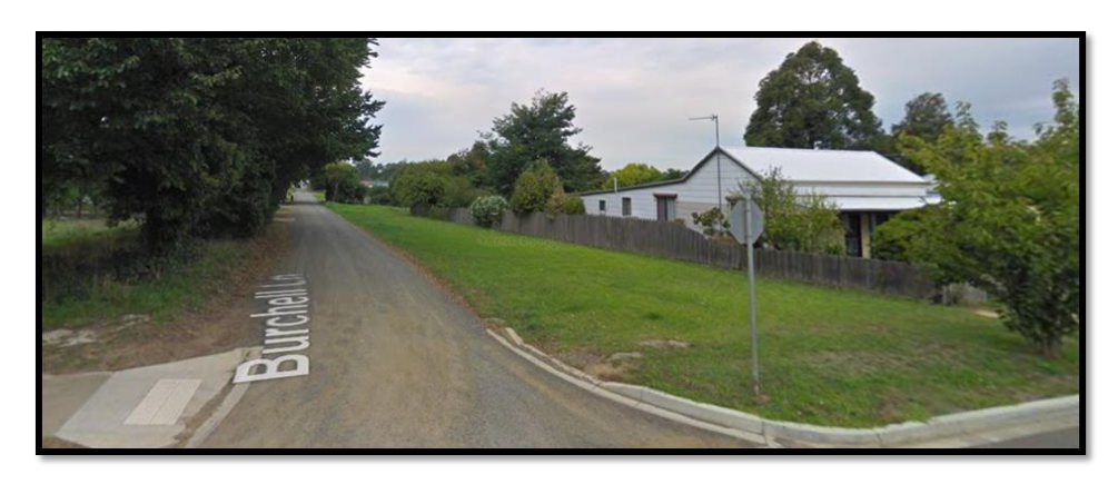
Figure 1 - View of 3 Brennan St on corner of Burchell Lane

In 1985, the former Shire of Mirboo purchased 3 Brennan Street, Mirboo North to assist with future plans of widening Burchell Lane, Mirboo North to improve access within the growth area of town. The South Gippsland Shire Planning Scheme contains a Public Acquisition Overlay (PAO) to enable Council to acquire road reserve along the section of Burchell Lane between Brennan Street and Peters Street.