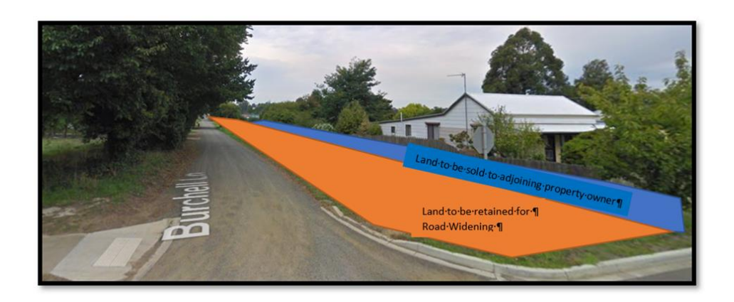
Figure 4 - Showing example of Public Acquisition Overlay along Burchell Lane in orange and the lot to be created and sold in blue.