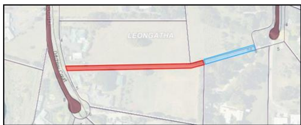
Figure 4 – Remaining Small Reserve Strip (highlighted blue)

If Council, choose to sell part of the reserve the small reserve strip off Davis Court will remain, but the community engagement process may produce interest in the site.