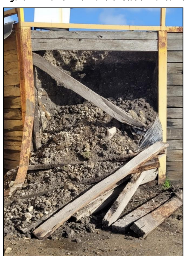
Figure 1 - Walkerville Transfer Station Failed Retaining Wall

Following a recently completed tender process for the construction of Cell 5 (Stage 1) at the Koonwarra Landfill, savings have been identified in the Capital Works Program budget allocated to that project. It is proposed that these funds be utilised to undertake the replacement of the Walkerville Transfer Station retaining wall in the 2023/24 financial year, minimising any significant budget impacts in the short term and reducing the risks of service disruption.