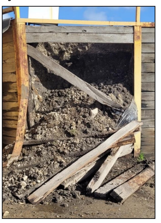
Figure 1 - Walkerville Transfer Station Failed Retaining Wall