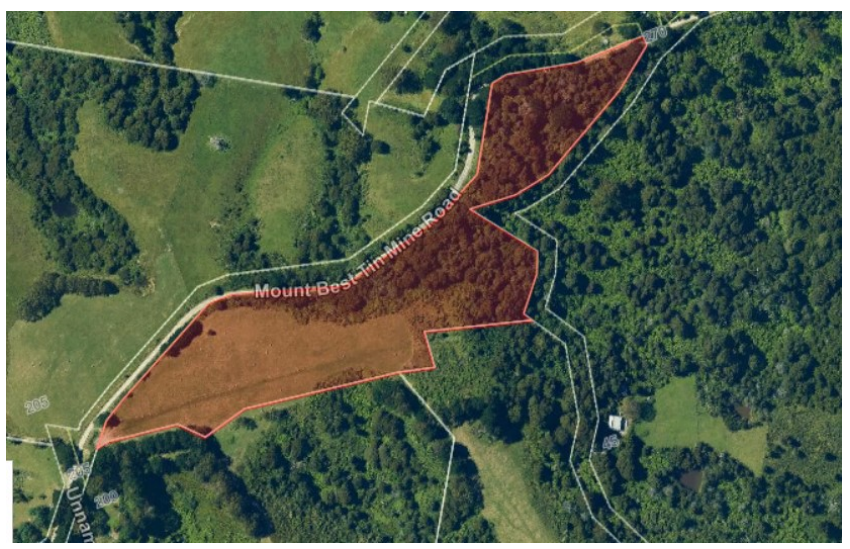
Figure 1 - 270 Mount Best Tin Mine Road, Toora North

This property is locally known as the "Mt Best Air Strip". The land was used in the past for planes to help combat fire in the region but helicopters have replaced planes and don't require a runway. The site also used to be used by agricultural spraying planes but there does not appear to have been used for this purpose in some time. The land is in a farm zone with an area of 6.219 Ha with approximately 50% vegetation. It is not proposed that Council apply for a planning permit for a dwelling.