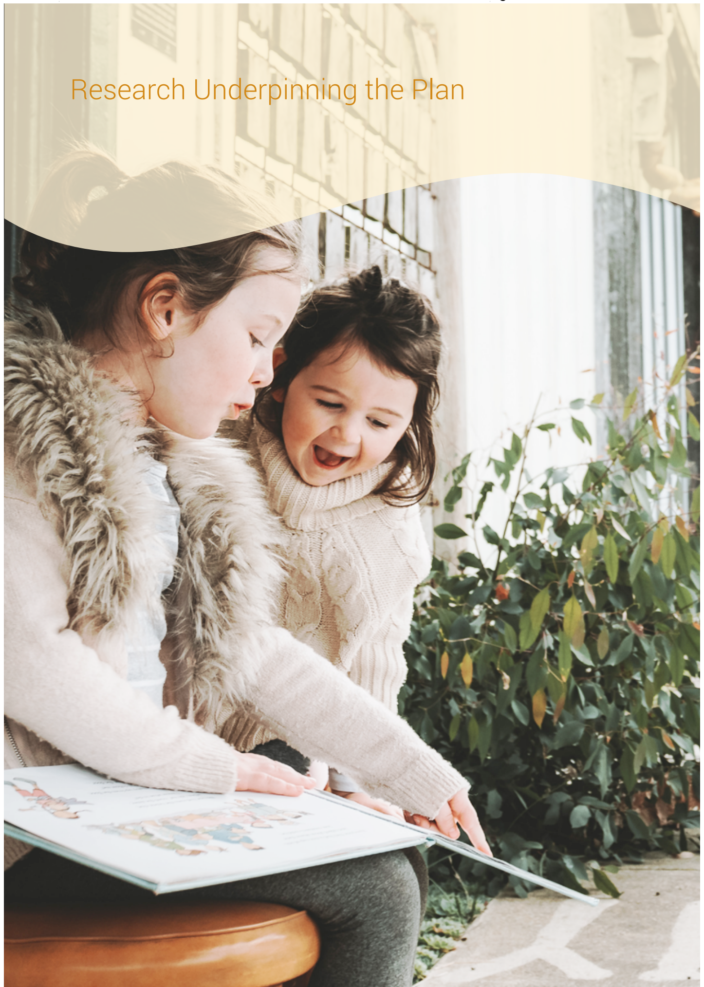
South Gippsland Shire Council