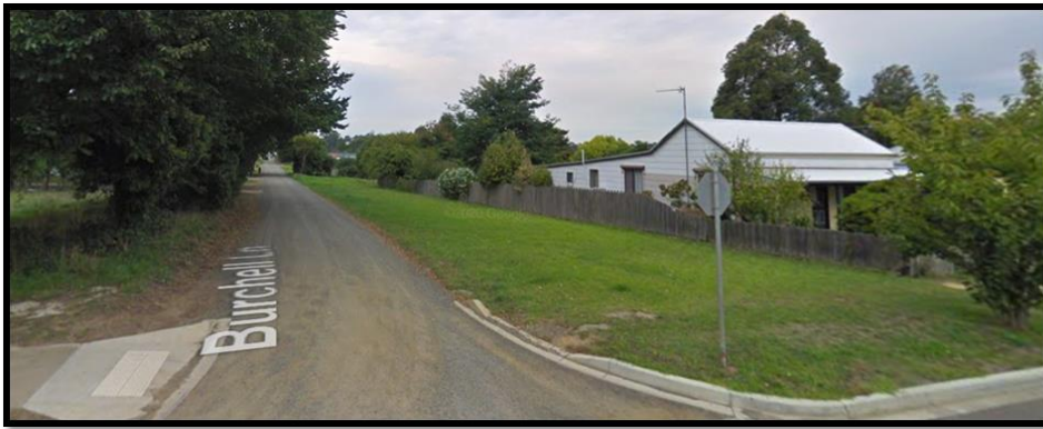
Figure 1 – View of 3 Brennan St on corner of Burchell Lane

In 1985, the former Shire of Mirboo purchased 3 Brennan Street, Mirboo North to assist with future plans of widening Burchell Lane, Mirboo North to improve access within the growth area of town. The South Gippsland Shire Planning Scheme contains a Public Acquisition Overlay (PAO) to enable Council to acquire road reserve along the section of Burchell Lane between Brennan Street and Peters Street.