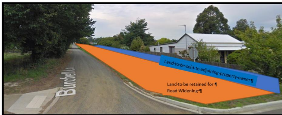
Figure 4 - Showing example of Public Acquisition Overlay along Burchell Lane in orange and the lot to be created and sold in blue.