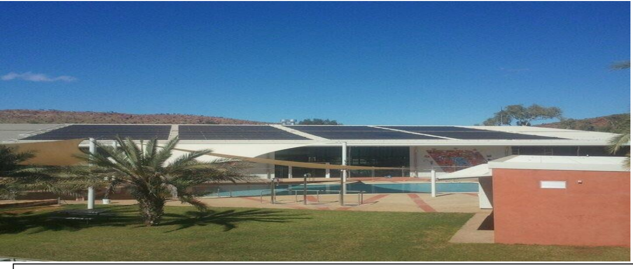
An example of a shading area that could also include solar panels on the roof

Note that a combined polycarbonate structure could be designed to have the strength to support the solar panels and provide shading for the pool similar to the photo below. This structure would be more costly than PVC barrel arch described below but given the total costs of the heating and shading proposals a combined structure would probably be more cost efficient than if each element of the proposed improvements were undertaken separately. If a decision is made to combine the two objectives of heating and shelter into a single stage rather than separately over a few years then a combined structure would be logical. It is also worth noting that whatever design/cost outcome the proposed FPA would determine in this regard the costs would rest with the FPA and that Council & ratepayers would not necessarily be called upon to contribute. This report is not designed to provide a definitive plan but indicates research that establishes that suitable models exist and are within the fundraising capacity of the community provided there is in principle Council support for the FPA fundraising activities.