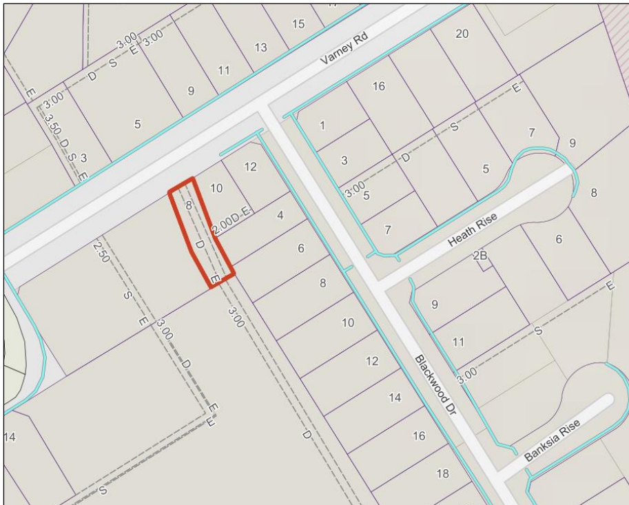
Figure 1 – Locality Map 8 Varney Road, Foster

The subject land is bordered red in Figure 1 below.