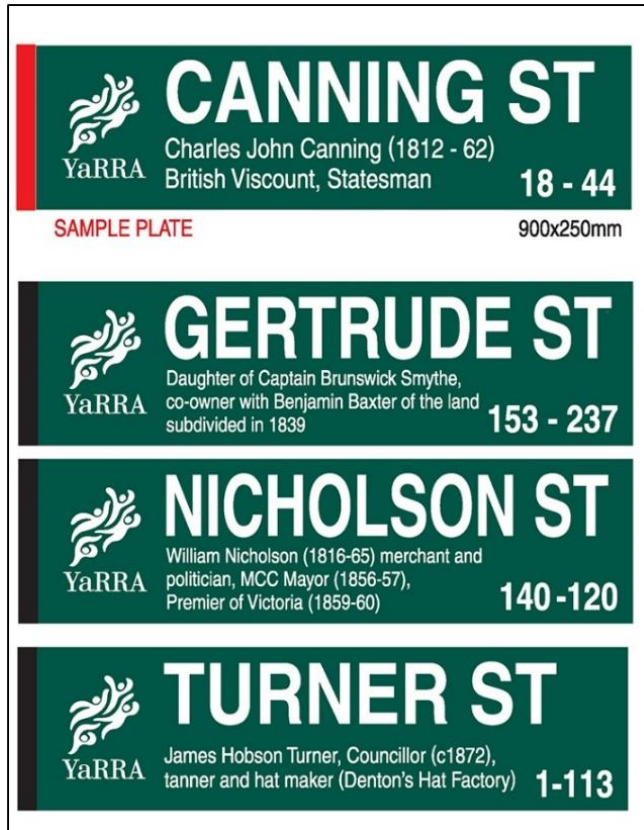
Figure 2 – Examples of Signage (Extract from Geographic Names Victoria Naming Rules)

The “In Principle’ support form is available in Attachment [4.3.3] - Geographic Names Victoria 'In Principle’ Support - Stag - Oct 2018.