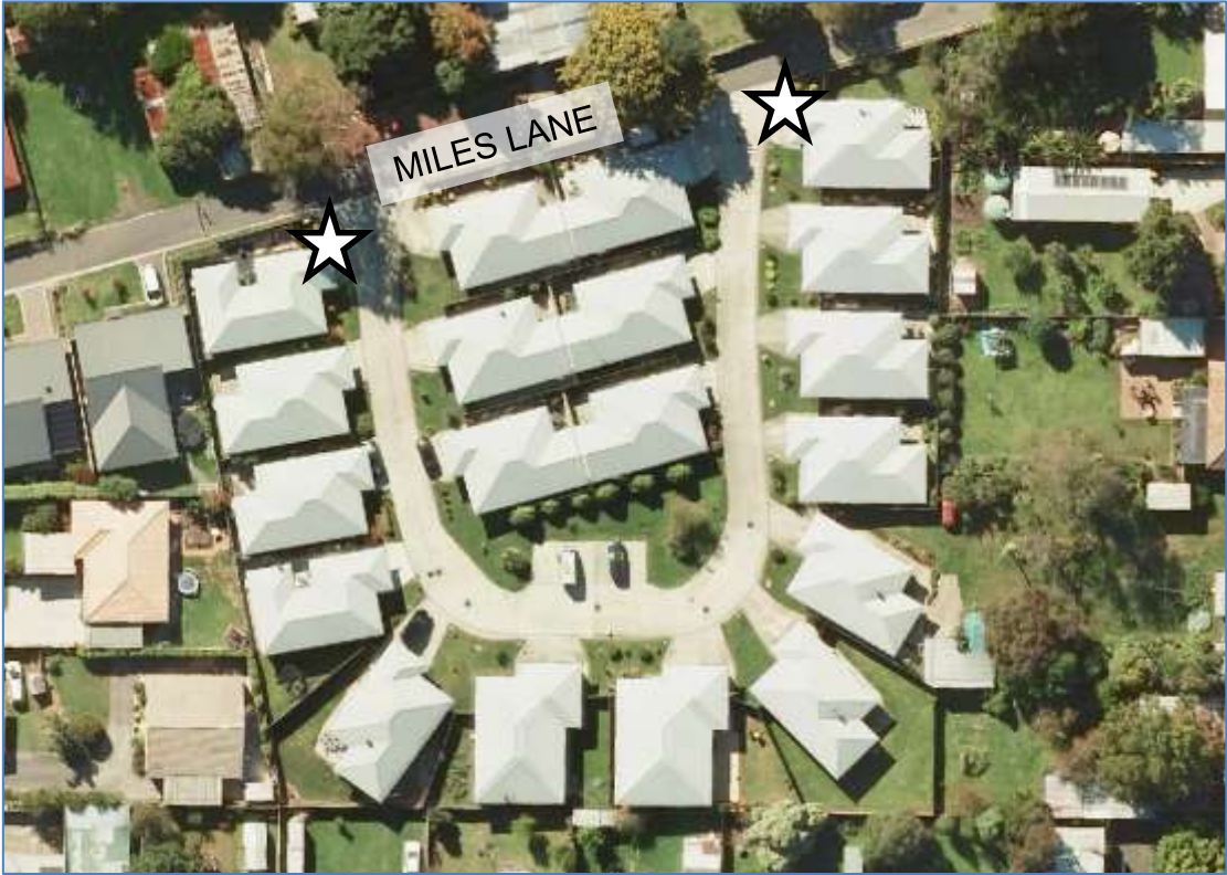
★ Proposed location of security lighting for 4 Miles Lane, Leongatha.