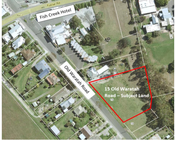
Figure 1. Proposed rezoning of 15 Old Waratah Road from PPRZ to TZ.

Nine objections were received to the proposed rezoning of 15 Old Waratah Road Fish Creek (4,100 square metres) from the Public Park and Recreation Zone (PPRZ) to the Township Zone (TZ) – refer Figure 1.