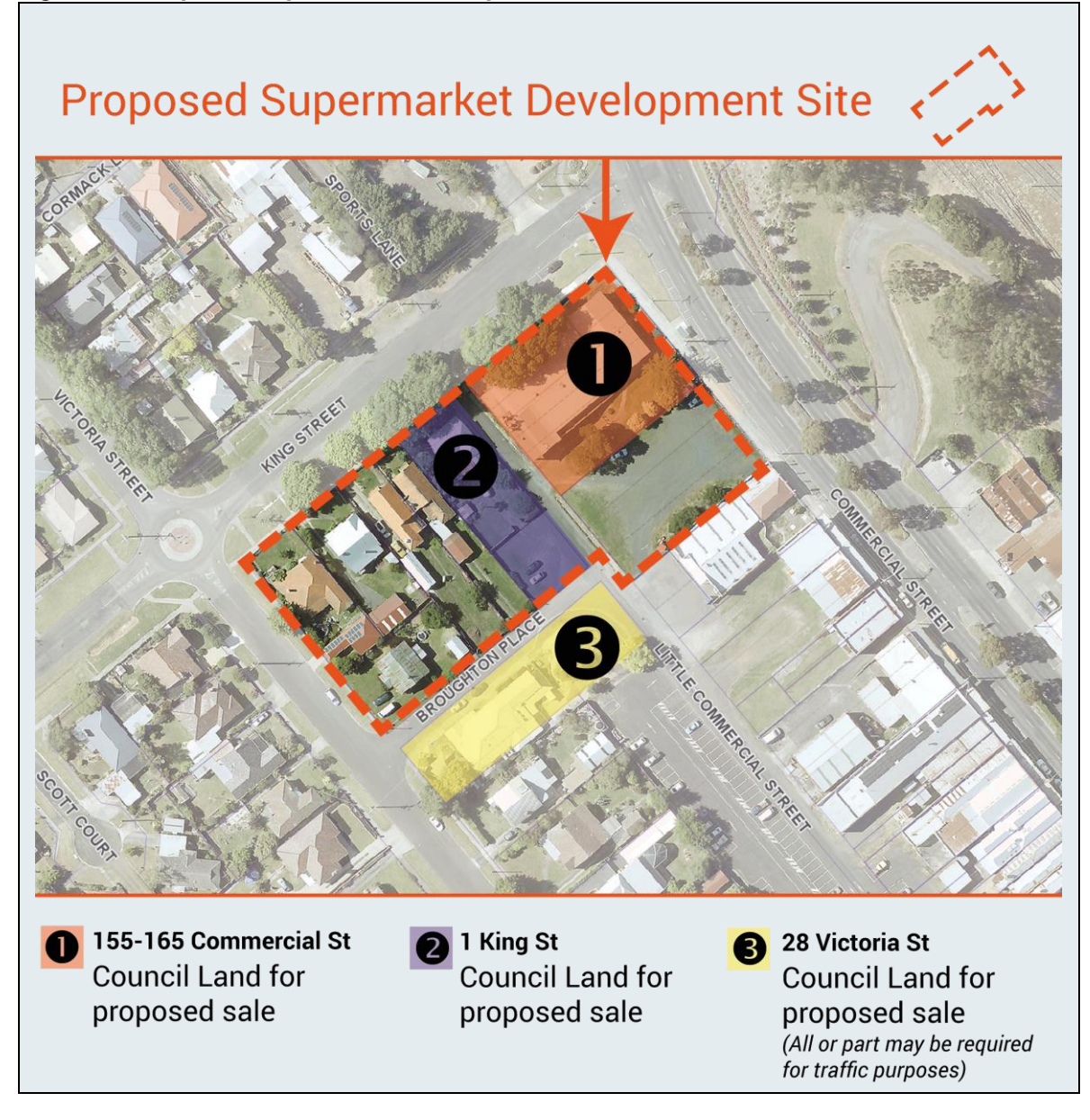
Figure 1 – Proposed Supermarket Development Site