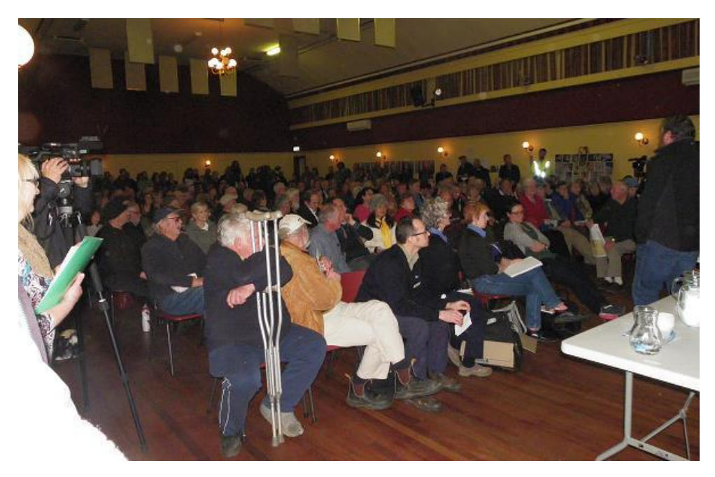
Picture: 14 September 2017 over 350 or about 20% of the community members attended.

Three coupes in Mirboo North District are scheduled for logging in mid 2018 and were listed in the 2017 Timber Release Plan: Oscine, Doug and Sampson Coupes. The proposal is about logging three coups of around 112h.