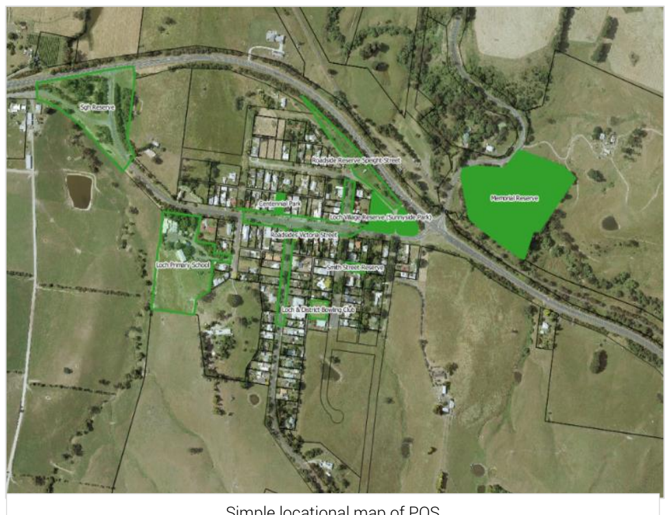
Simple locational map of POS

Work completed on the new 2018/19 OSS to date has provided a database, including private and state owned public open space land, which will more easily adjust to changed policy, allowing greater accuracy of information for decision making at any particular time, regardless of when an Open Space Strategy was developed. It also allows for the greater engagement of the community in understanding public open space in the wider landscape and user catchments.